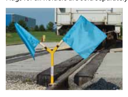
Flags for all holders are sold separately.